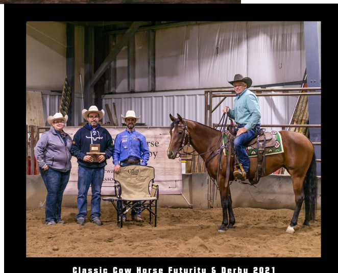
Classic Cow Horse Futurity & Derby 2021

August 19-21, 2022 Prairieland Park Saskatoon, Sask.