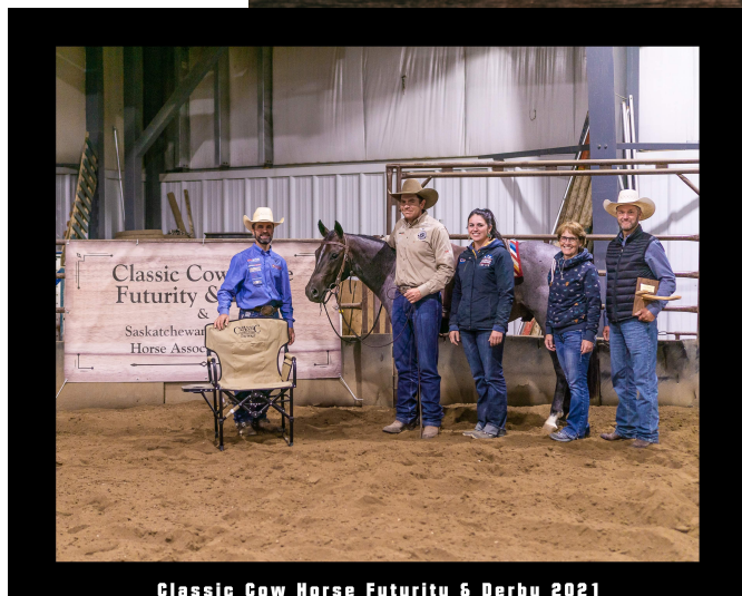
Classic Cow Horse Futurity & Derby 2021